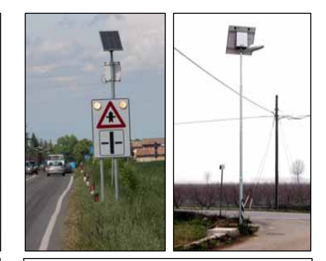
Systems for street lighting and signalling