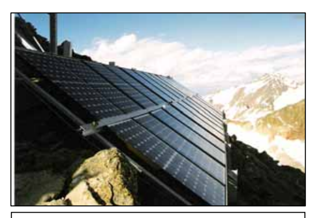
Stand-alone systems for the electrification of houses, alpine refugees, communities in rural areas, etc.

ENERECO srl has developed a series of pv kits complete with electrical material to be used for: