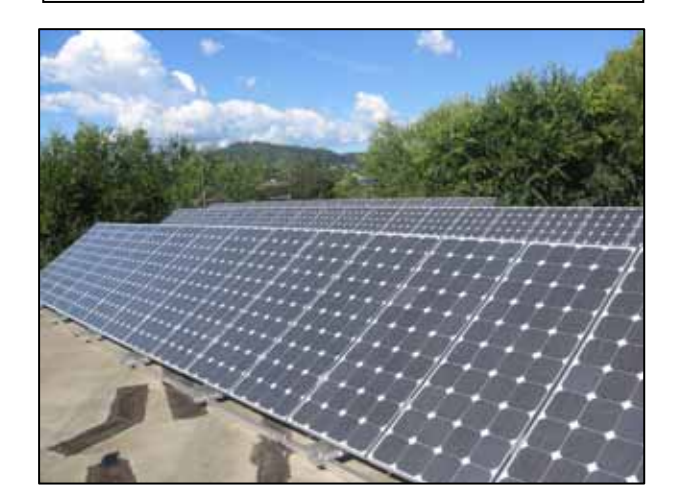
Grid-connected systems for buildings connected to the public electric grid

Stand-alone HYBRID systems (photovoltaic-windhydroelectric) for the rural electrification